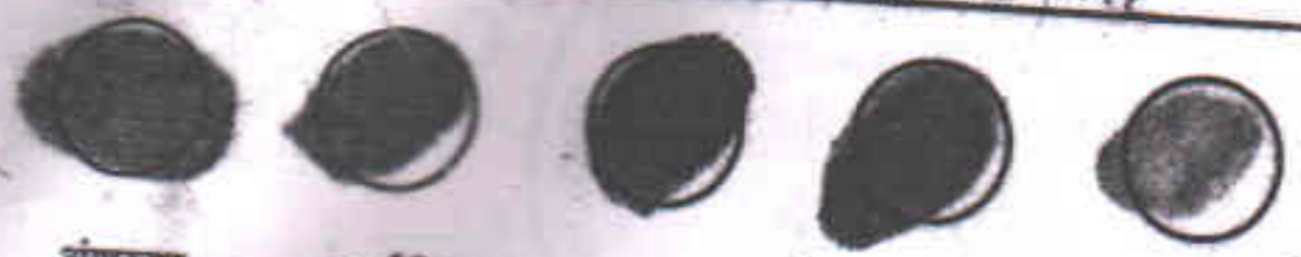
अंगुष्ठिका तर्जनी मध्यमा अनामिका कनिष्ठिका