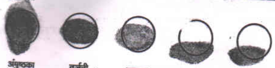
अंगुष्ठिका तर्जनी मध्यमा अनामिका कनिष्ठिका

नाम निष्पादनकर्ता/विक्रेता/केला दाहिने हाथ