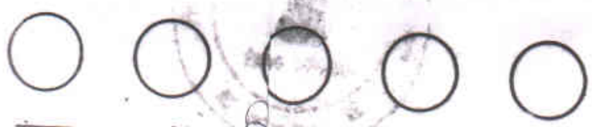
अंगुष्ठिका तर्जनी मध्यमा अनामिका कनिष्ठिका