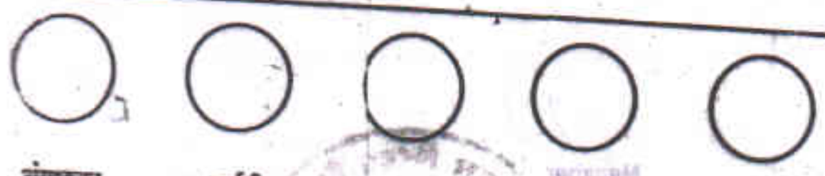
अंगुष्ठिका तर्जनी मध्यमा अनामिका कनिष्ठिका

नाम निष्पादनकर्ता/विक्रेता/केला दाहिने हाथ